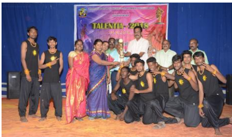
TALENTIA - 2018