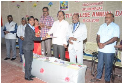
College Annual Day