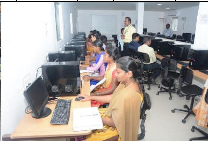
Hands on Training Programme in Reference Management Tools for Research Scholars