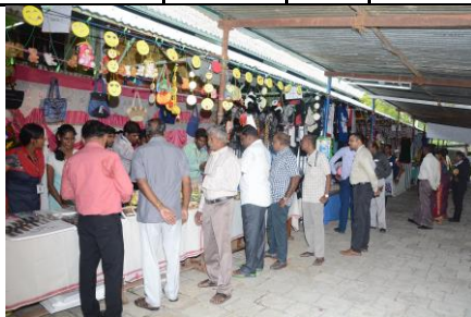
Department of Management Studies organised National level Management Meet MOTO'18