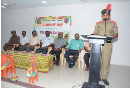
NCC – Diamond Jubilee Year – Company Day