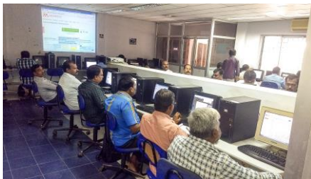
Hands on Training for the staff members on Mendeley for effective Reference Management