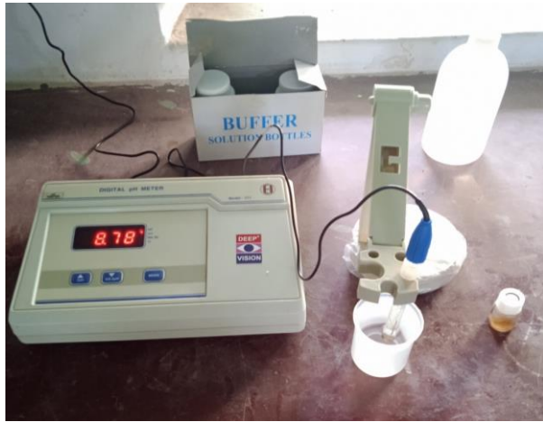
Digital pH meter