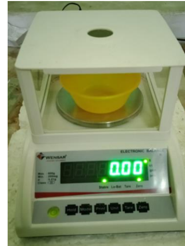
Electronic weighing balance