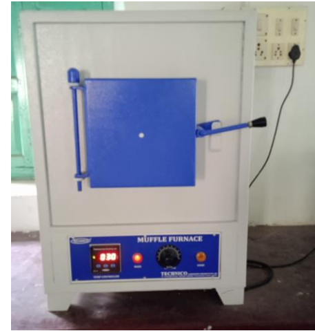
Electric muffle furnace