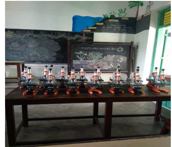
Compound Microscopes 23 Numbers