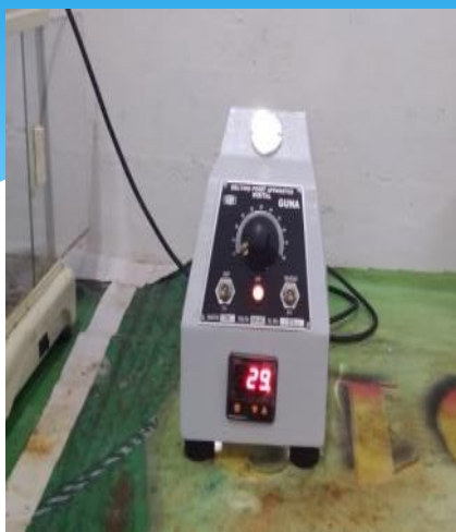
Melting point apparatus