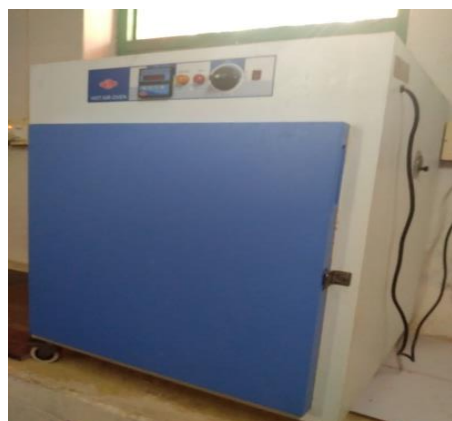
Hot Air Oven